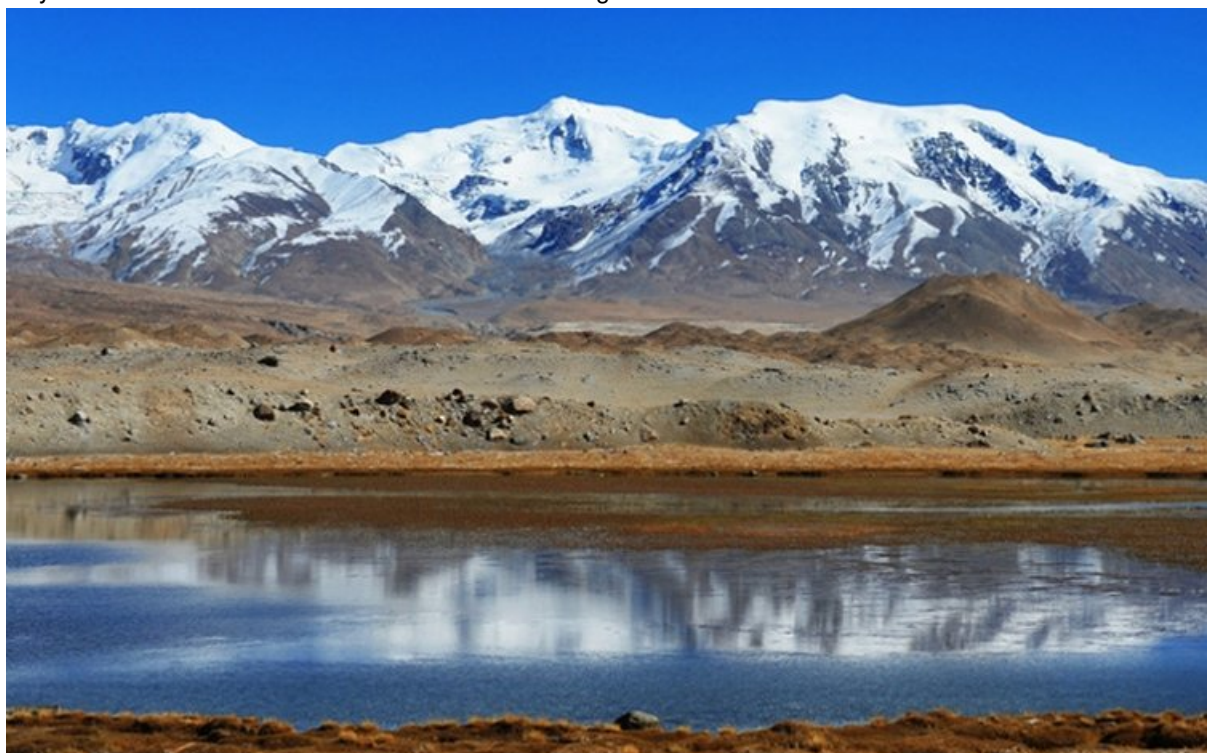
Day 07: Day Excursion to Karakul Lake - Drive Back to Kashgar

Enjoy a scenic drive from Kashgar to the splendid Karakul Lake , which takes over 3 hours. Stop at the Opal Village to view the spectacular scenery of Kunlun Shan Mountains. Then enter into the mountain range and get to the Mount Muztagata, also called as "the Father of Glaciers", the lake is situated at the foot of this majestic snow mountain.