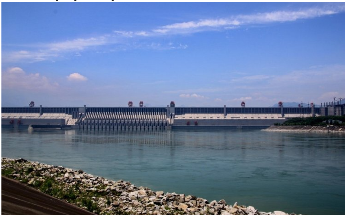
Day 12: Cruise to Yichang - Flight to Shanghai

This morning, stop at the Three Gorges Dam to visit this largest and most magnificent hydroelectric project in world. Then check out from the ship in Yichang at noon. Once you disembark, be greeted and assisted to the airport by our guide for the flight to Shanghai. Get settled into the downtown hotel after your arrival in Shanghai. The rest of today is on your own. Overnight in Shanghai.